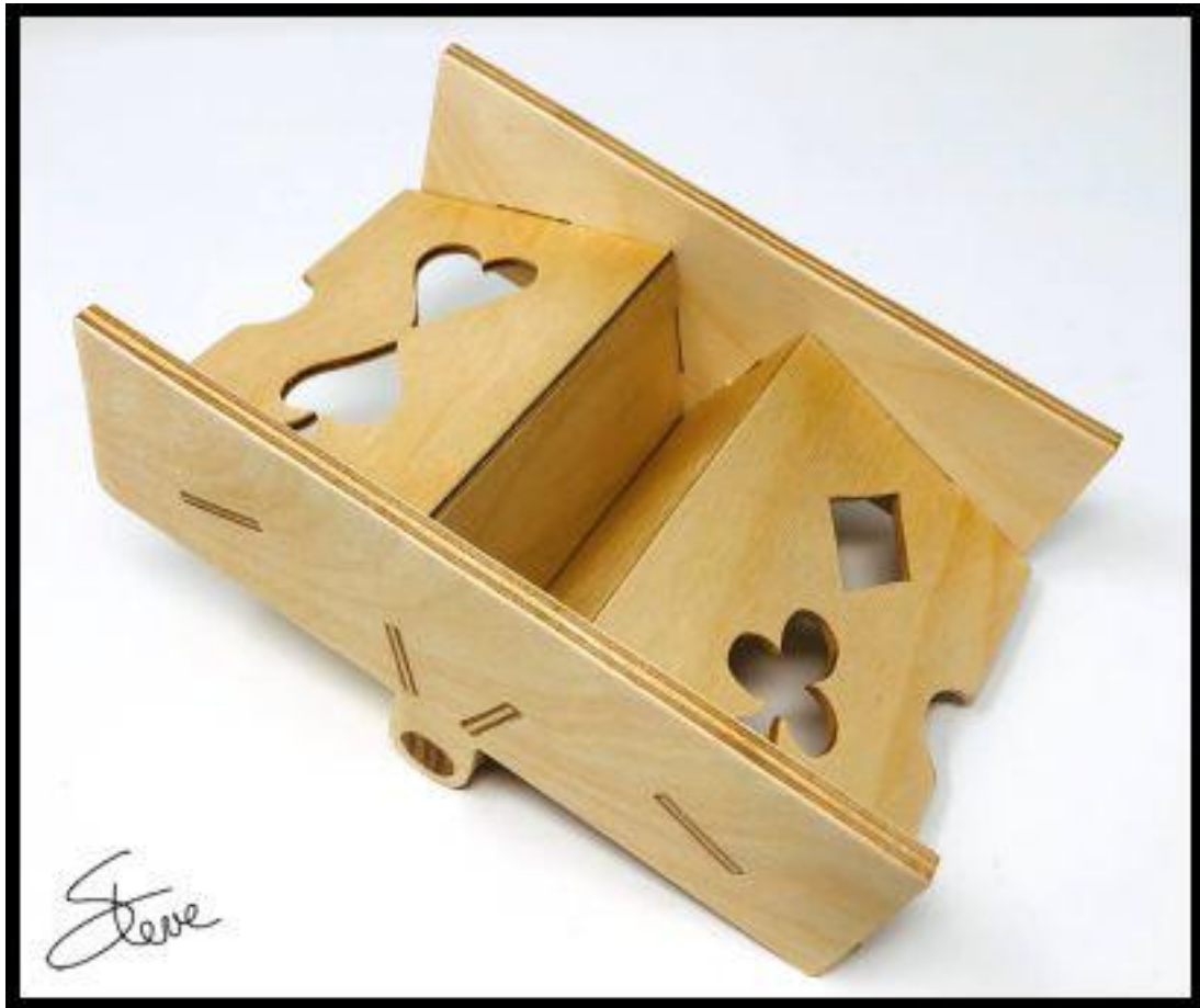
This picture shows the bottom of the card caddy.