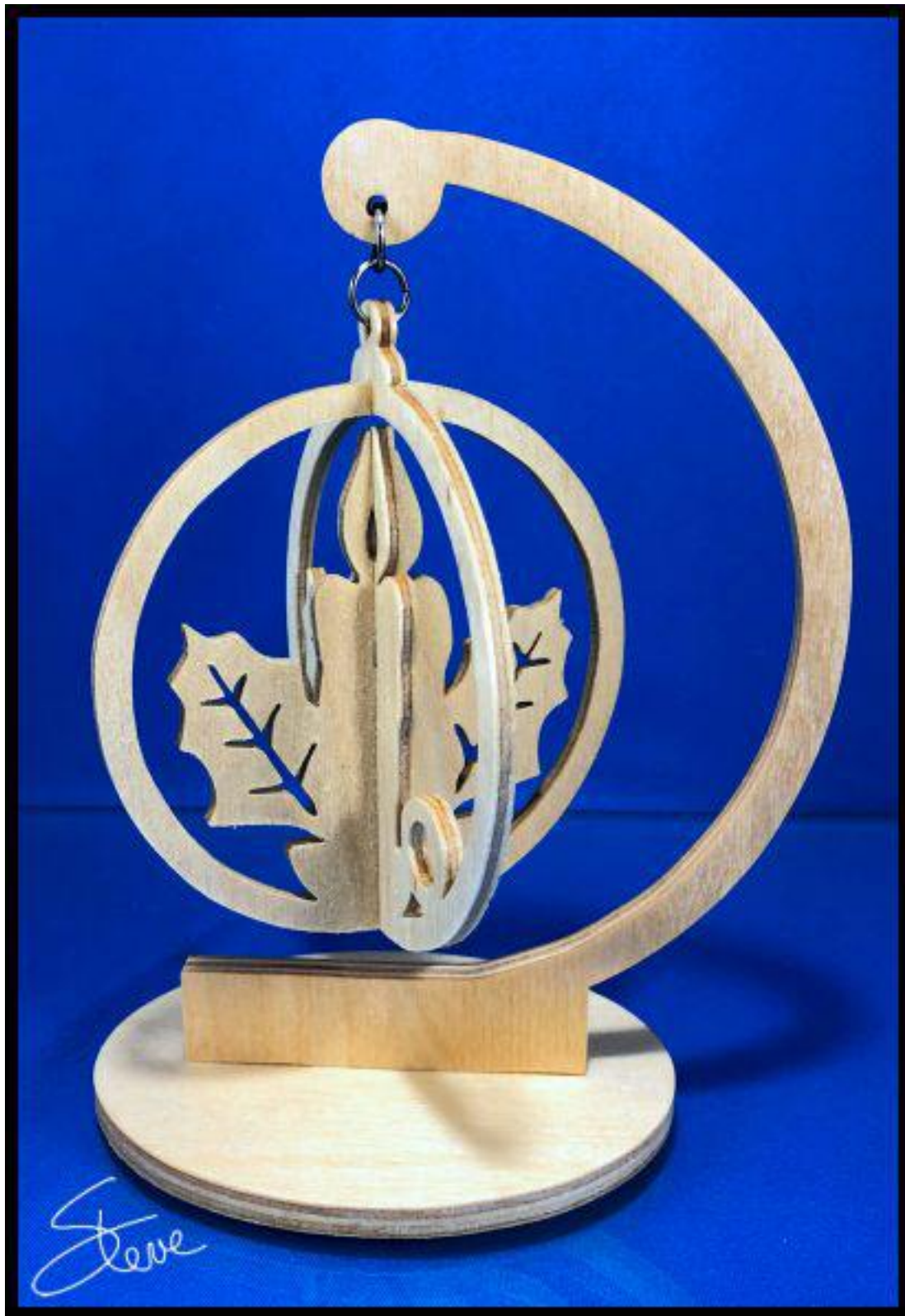
Candle Ornament with Display Stand