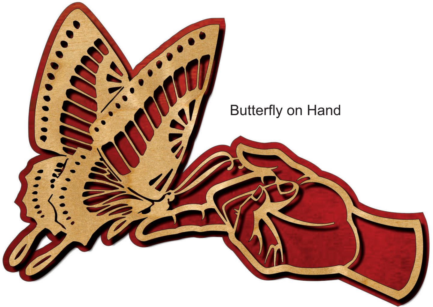
Butterfly on Hand