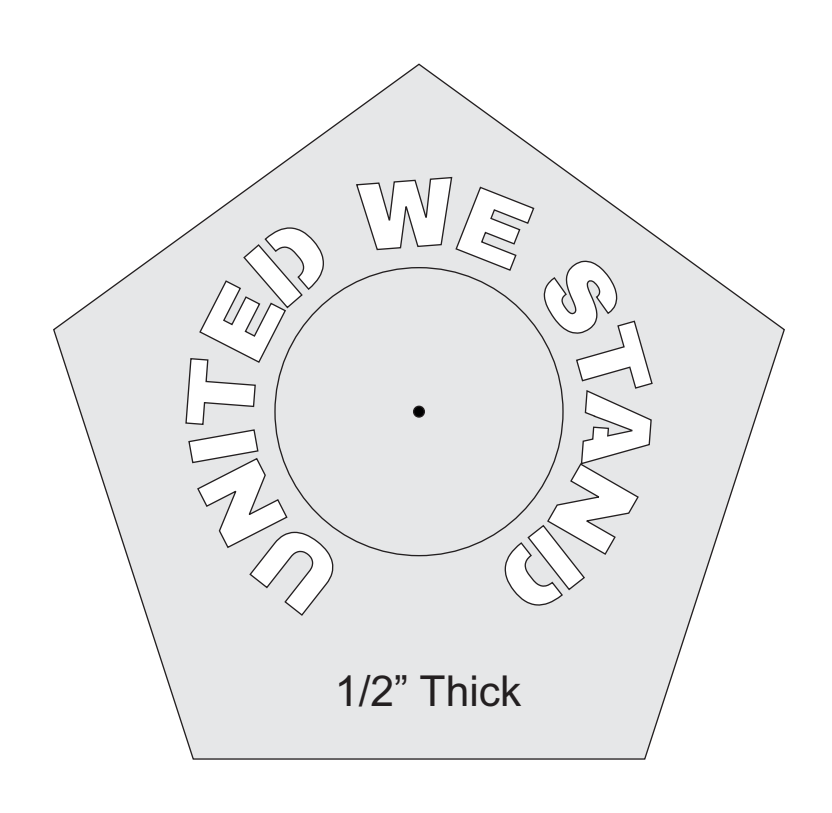
Use a 1.5" Forstner bit to counter sink the coin. Designed for the Eisenhower Bicentennial Dollar