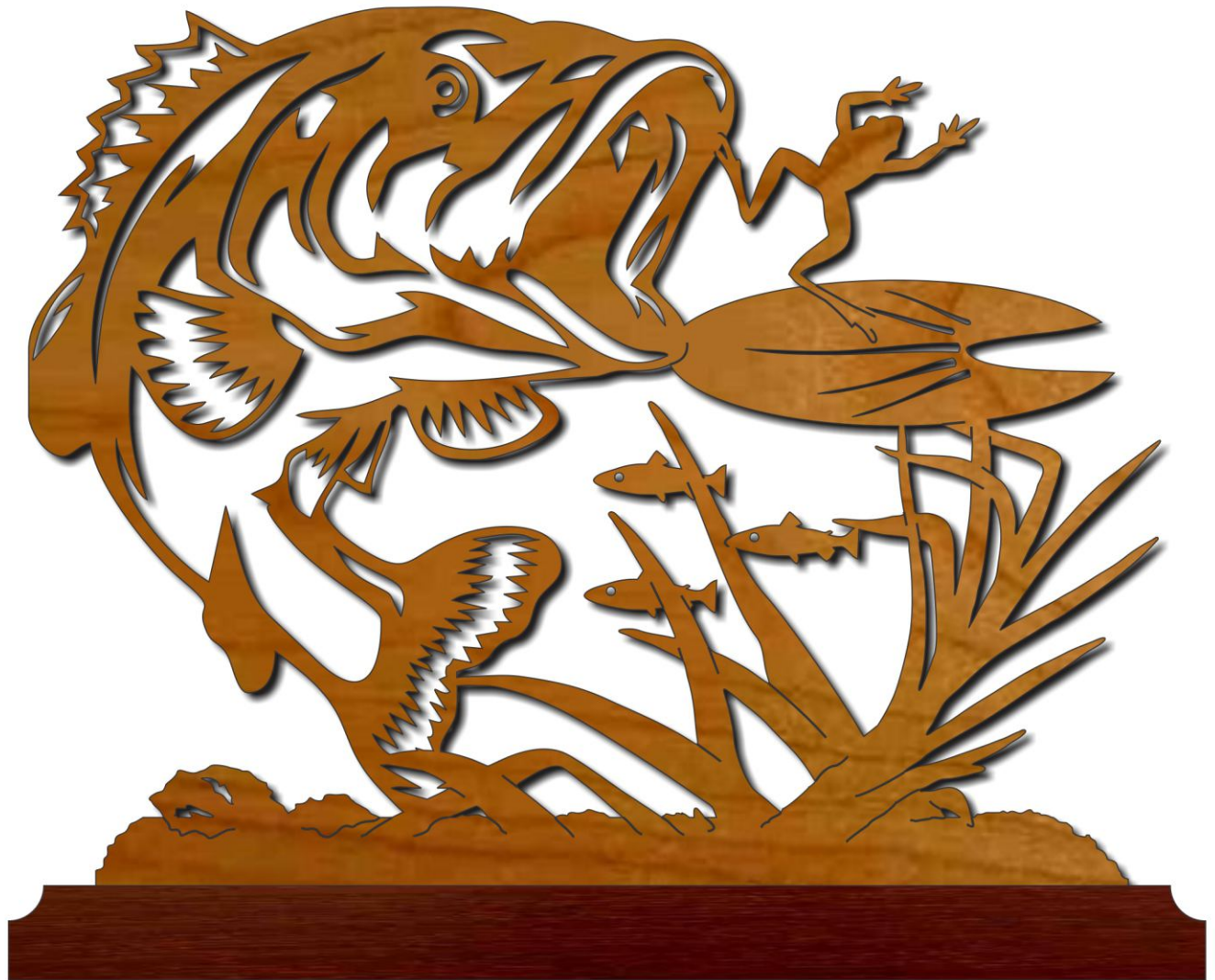
Bass and Frog