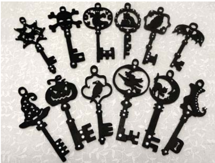
SLD438 Spooky Scrolled Key Ornaments Set

If you liked this pattern, you may enjoy the full sets of patterns . . .