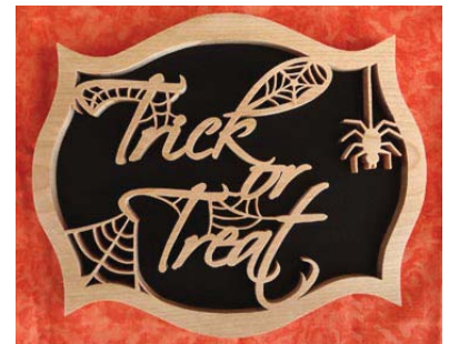
SLDK214 Trick Or Treat Spider Plaque