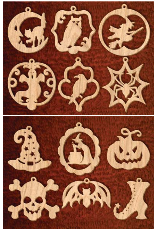
SLD439 Spooky Halloween Ornaments Set