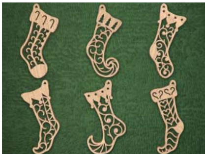
SLDK327 Filigree Stocking Ornaments

Other Sheila Landry Designs Patterns . . . .