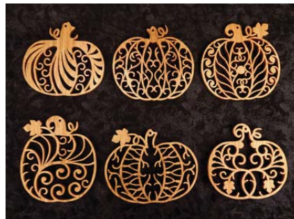
SLDK309 Filigree Pumpkins Ornaments