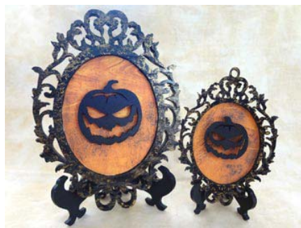
SLDK399 Halloween Silhouette Self-Framing Orns. and Plaques