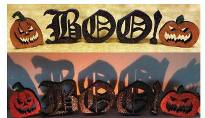
SLD403 BOO! Word Art