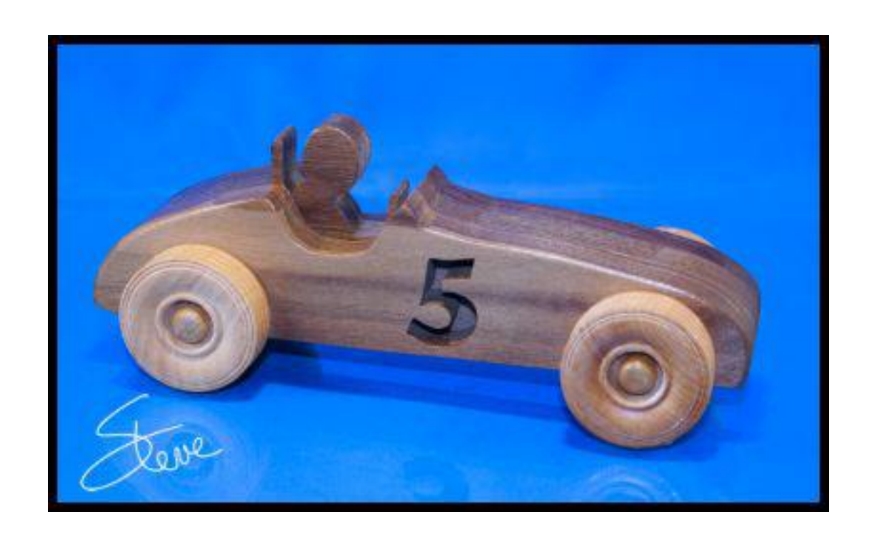
Requires 1.5" diameter wheels and axels. www.bearwood.com