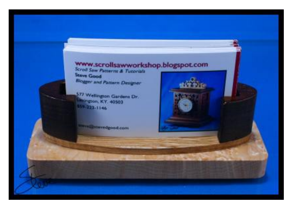
Holds about 1/2 inch thick stack of business cards.